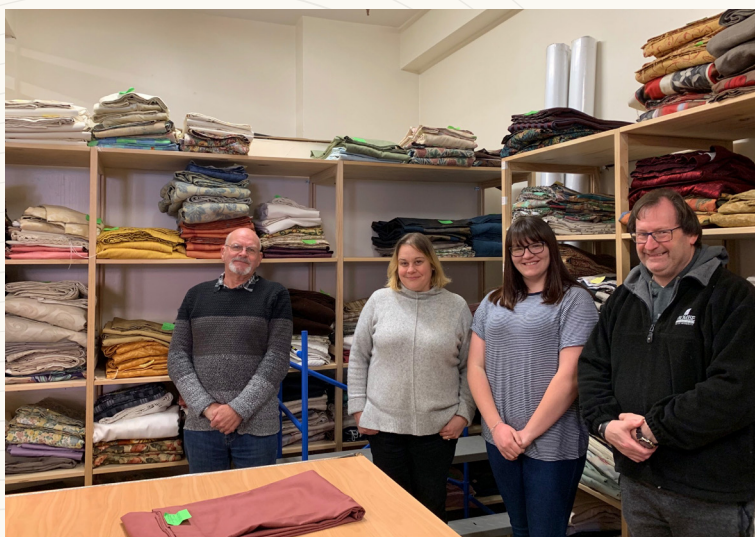
The team at Dunedin Curtain Bank